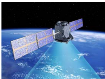
GIOVE-A